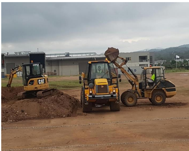
Figure 3 – Students training on plant machines (L-R) Excavator, Articulated Haul Truck & Front End loader