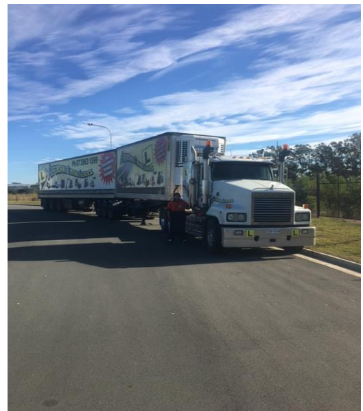
Figure 1- Multi Combination Truck