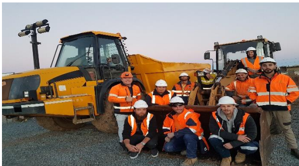
Figure 2 - RII30115 Certificate III in Surface Extraction Operations Class posed with the Articulated Haul Truck and Front End loader machines

Funding available: CSQ or Cert III courses. Eligibility needs to be met.